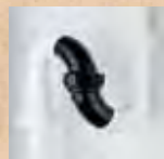
Plumbing & Air Ducts

To Order Call: 1-800-817-8968 FOR MORE INFORMATION: www.quickclampwrap.com