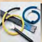
Marine, Sport & Tool Grips